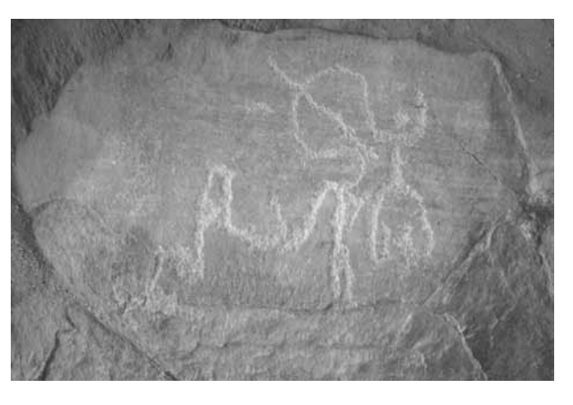
Fig5 Tazina Sluguilla